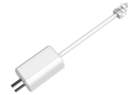
LR1002 ePoE Over Coax Converter